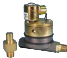
Series 767 Electric/ Pneumatic Actuator Request Publication 30.62