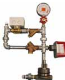
AutoConvert Trim Assembly Request Publication 30.84 or 30.85 for LPCB Approved options.