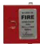
Series 755 Manual Pull Station Request Publication 30.41