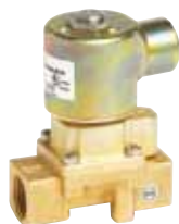
Series 753-E Solenoid Actuator Request Publication 30.63