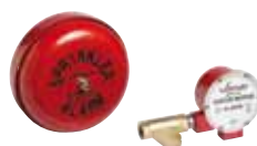
Series 760 FireLock Water Motor Alarm Request Publication 30.32