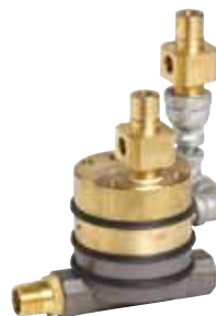
Series 798 Double Pneumatic Actuator (For use with Series 769 FireLock preaction system check valves only) Request Publication 30.61