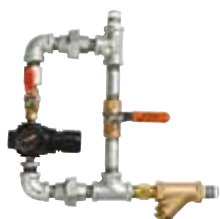
Series 757 Air Maintenance Trim Assembly Request Publication 30.35