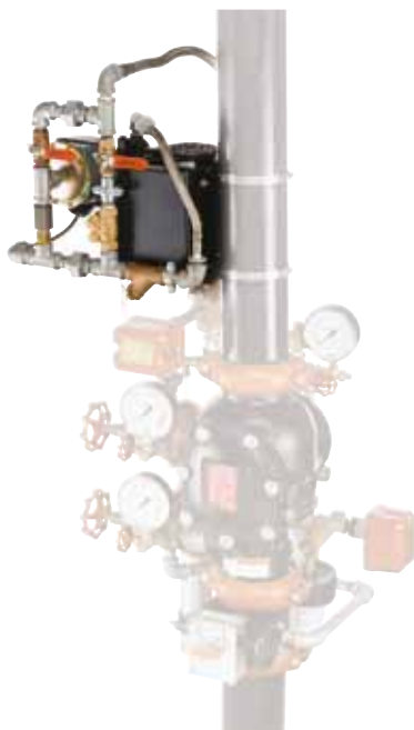
Series 7C7 Compressor Package Request Publication 30.22